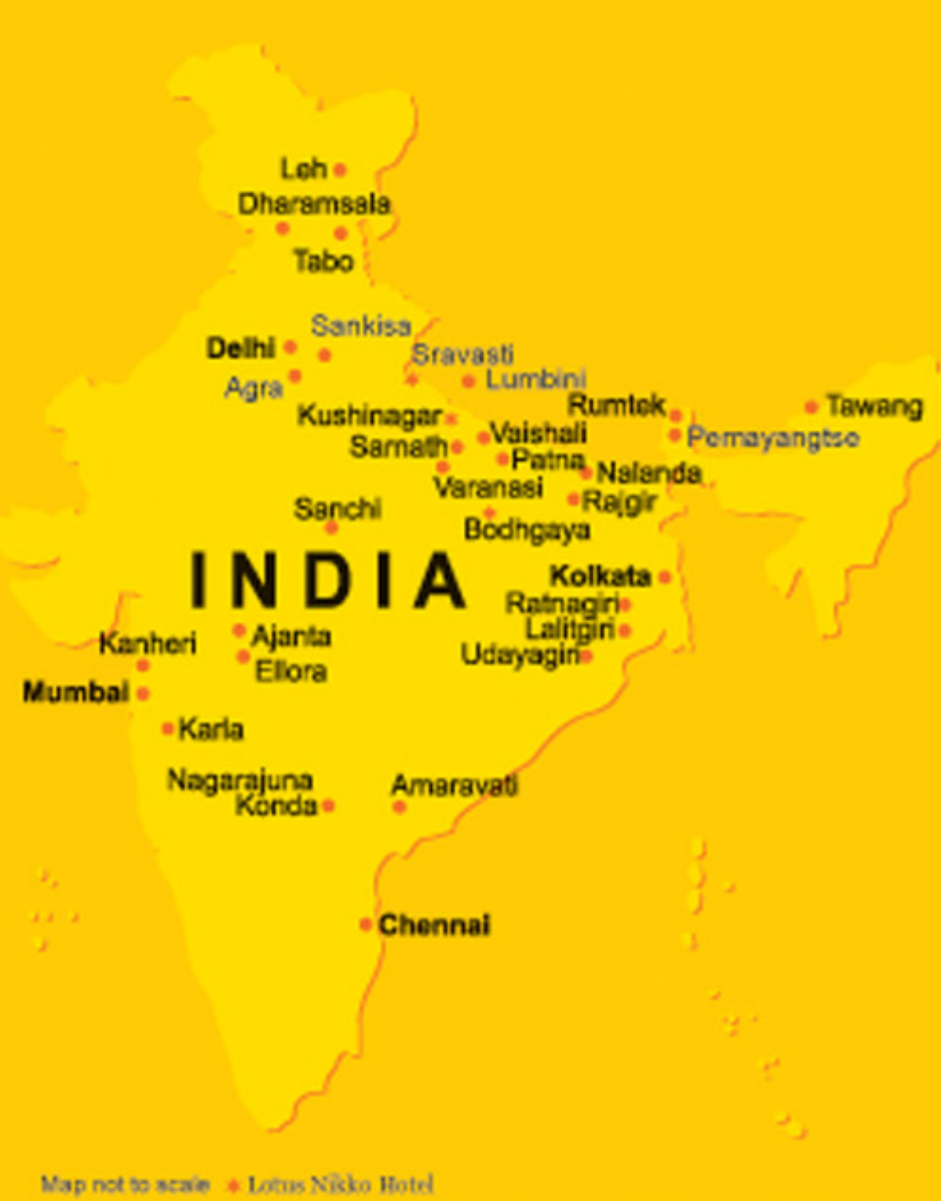
Map not to scale. © Lotus Trans Travels